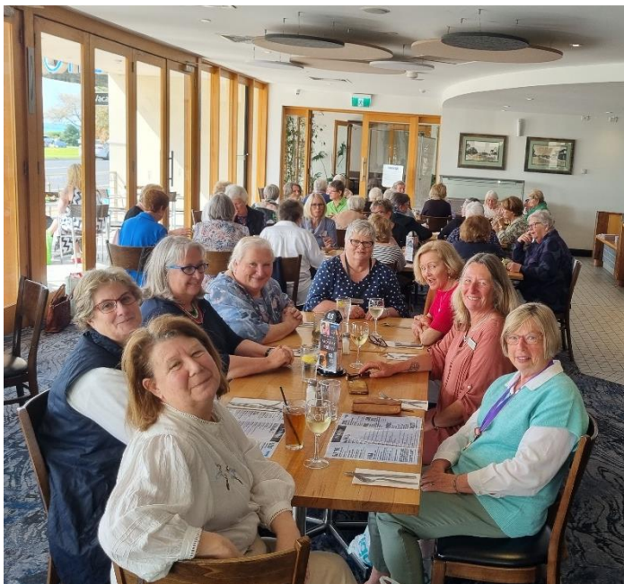
Our lunch group almost took over the Rye Hotel Bistro with 41 members staying or lunch.