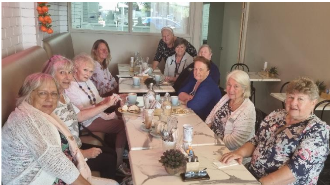
C@C - Happiness First