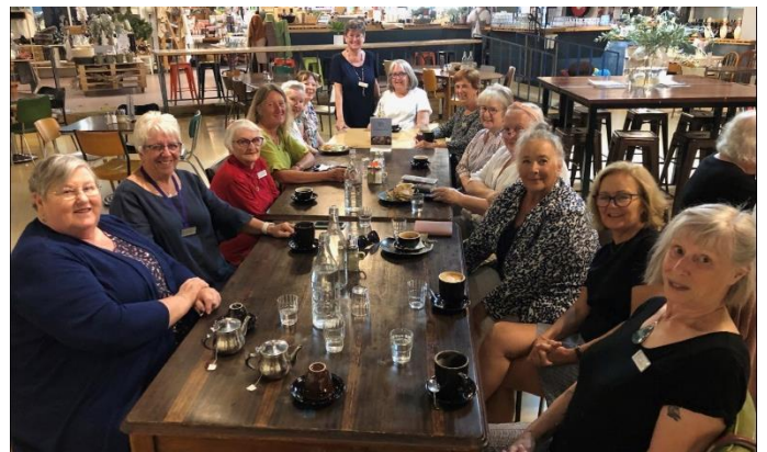
C@C – Blue Mini