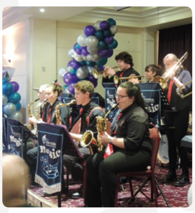
The Bairnsdale Secondary College Band had guests singing and dancing at the inauguration.

With a Smith Family office located in Bairnsdale and a number of programs including the successful Girls at the Centre Indigenous program running in the area, the club's committee is looking forward to developing a close relationship with The Smith Family. The club's new members are keen to be involved in volunteering and other opportunities to support local students.