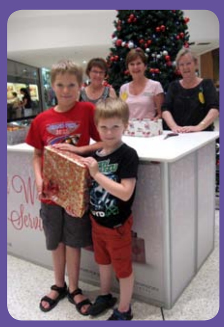
Christmas wrapping with Kenmore Evening VIEW Club

A significant number of VIEW members nationwide volunteered their time to take part in Christmas wrapping activities to raise funds, as well as their profile in their local communities. In December, members set up stalls in NSW at Erina Fair on the Central Coast. Stockland in Nowra, Toormina Centre in Sawtell and Centro Tweed Heads. In Oueensland, stalls were set up in Southport Park Shopping Centre, Stafford City Shopping Centre, Centro-Springwood Shopping Centre and Mt Ommaney Shopping Centre.