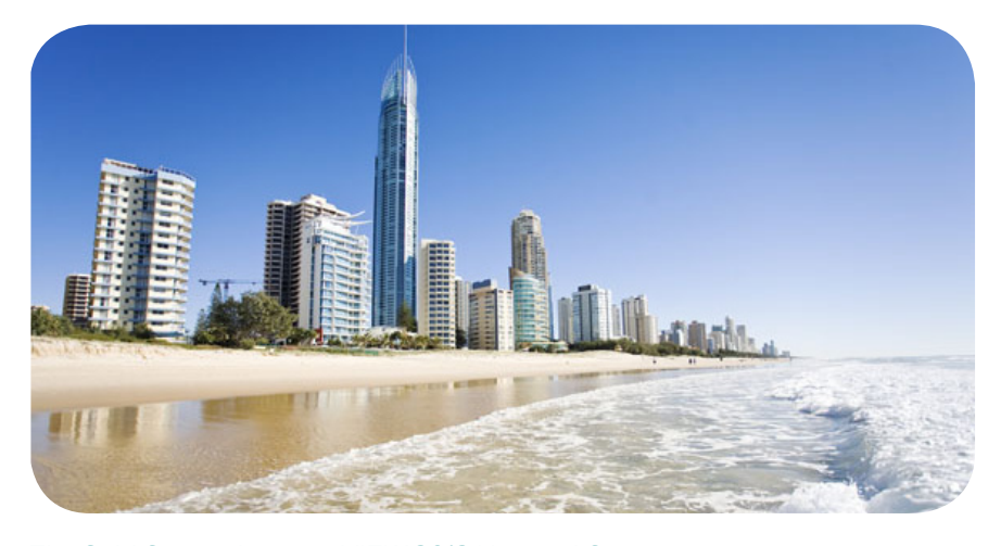
The Gold Coast - home to VIEW 2013 National Convention

VIEW is coming to the Gold Coast after an absence of 10 years, holding the 2013 National Convention at Jupiters Hotel & Casino.