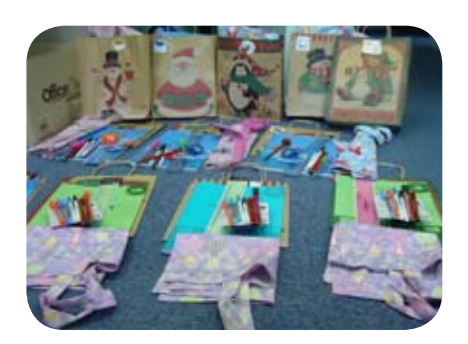
Gift bags donated to Seven Hills Learning Club students by Sylvania VIEW Club

Each student received a certificate for participating in the Learning Club for 2012, along with a gift bag containing stationery items kindly donated by Sylvania VIEW Club.