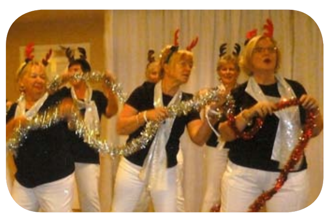
Harrington Evening VIEW Club members perform Christmas carols

Members and guests of Harrington Evening VIEW Club dressed in their best silver and white outfits to attend the Club's Christmas party at Harrigan's Irish Tavern last November. Christmas carols with a twist were performed by members, with everyone joining in the singing and action, then Rudolf (complete with red nose) led the other reindeers in a lively conga line. Santa had a hard time checking his Christmas list trying to find out who had been naughty or nice.