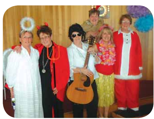
VIEW members dress up for Elvis meets Christmas in July celebration

Sixty eight members and friends of Mudgee VIEW Club enjoyed lively musical entertainment, fancy dress and the opportunity to view a special collection of Elvis memorabilia as part of an 'Elvis meets Christmas in July' luncheon. In the spirit of Christmas, members donated cash and stationery to The Smith Family for students supported through the Learning for Life program.